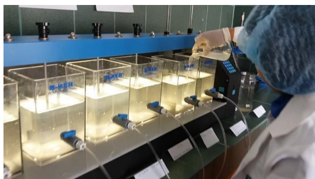
Figure 1. Treatments performed on the Jar Tester equipment

Table 5 shows the results of the Tukey significance test for simple effects of turbidity (NTU). Factor A shows statistical differences when combined with the levels of factor B, the highest average being a0b0 with 16.1 NTU, followed by a0b1 with 11.5 NTU; the lowest average is the combination a1b0. Figure 1 shows the treatments performed in the Jar Tester equipment.