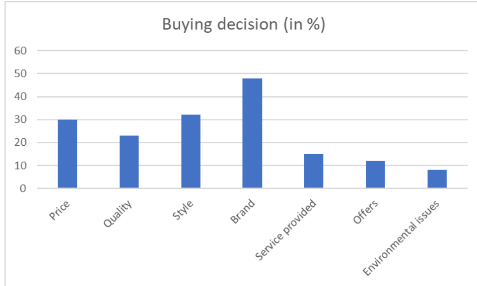
Figure 4: Main factors influencing purchase of luxury products

The respondents articulated that the most common purpose behind buying luxury products are to showcase their social status and riches, and secondarily the uniqueness of the product boosts their self-esteem. People also equated luxury brands with perceived superior quality of the product. The greater part of the respondents, 2/3 of them, demonstrated positive perceptions towards luxury products. Half of the young people were pretty much pre-existing luxury consumers. 1/3 of the individuals who didn't own luxury products demonstrated their enthusiasm to purchase them when they can afford it. Young consumer's aspiration for luxury products has been likewise observed in A.P and Telangana.