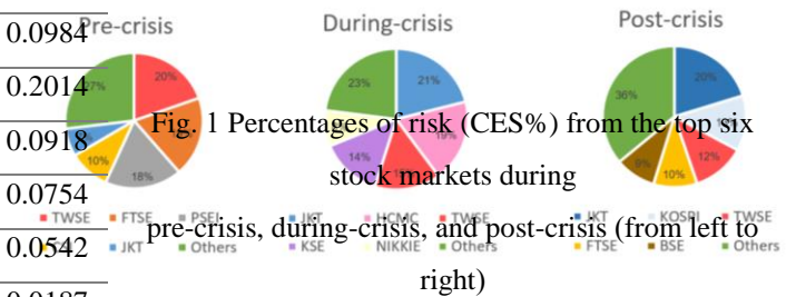
Fig. 1 Percentages of risk (CES%) from the top six stock markets during pre-crisis, during-crisis, and post-crisis (from left to right)

According estimate to the CES, the C-vine copula based on ARMA-EGARCH models is used to simulate the return of the Asian stock market at time t+1 . Therefore, 10,000 simulated returns are generated. From Table IV, the CES presents the sources of Asian stock markets' risk in three sub-periods. Figure 1 explains the top six stock markets which are contributing the risk to the Asian stock markets. Note that the higher percentage indicates a higher potential systemic risk. As we can see in figure 1, the TWSE of Taiwan and JKT of Indonesia are ranked in the top six stocks contributing a high risk to Asian stock markets in all three periods, indicating that these stock markets have a strong influence on the Asian markets. It is also observed that the TWSE contributes the highest CES% in pre-crisis, while JKT contributes the highest CES% during crisis and post-crisis periods. These findings suggest that investors should be cautious in investing in TWSE and JKT markets.