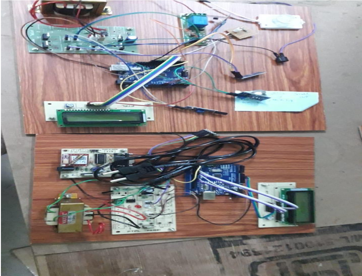
Figure 1 Arduino Setup

The Arduino Development Environment (IDE) includes a word processor for writing code, a message area, a book console, a toolbar with buttons for common functions, and a series of menus. As illustrated in Figure 1, it communicates with Arduino and Genuine equipment to transfer programmes and communicate with them.