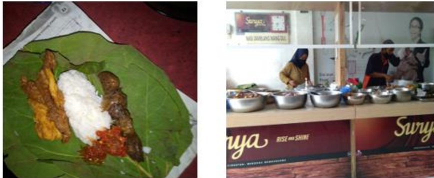
Fig. 1 Nasi Jamblang

"All Nasi Jamblang informants said that innovation and creativity must be able to develop and maintain the existence of Nasi Jamblang. We started this innovation and creativity by presenting it in a cooking area to make it look beautiful and attractive to arouse the appetite of visitors; Food variations bring a wide variety of food variants that can be eaten with Nasi Jamblang."