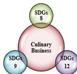
Fig. 4 Sustainable Development Goals

This study aims to determine the prospects and impact of the advancement of culinary businesses in developing the tourism economy in Cirebon, West Java. This research aims specifically to support the Sustainable Development Goals (SDGs), namely SDGs 8 (community economic growth in Cirebon), SDGs 9 (improving infrastructure and infrastructure for culinary businesses), and SDGs 12 (ensuring the economic behavior patterns of local communities and culinary visitors, in Cirebon). The following is a pattern of culinary goals with the goals to be achieved in the Sustainable Development Goals (SDGs):