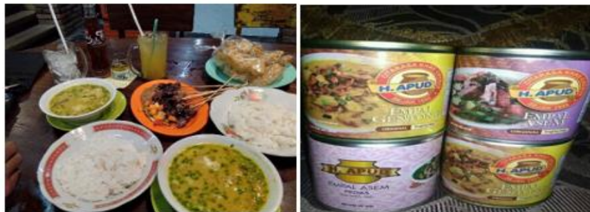
Fig.2 Empal Gentong Classic and Empal Gentong tin packaging

"All informants said that this creativity supports the sustainability of Empal Gentong's culinary prospects. Usually, we get ideas from our children who are indeed millennial generation, so they understand very well what the market share is, so we entrust the creativity of our children to give us what kind of ideas in developing this Empal Gentong culinary business, and now Empal Gentong can be used by -Good and will not be damaged for a week because it has been packaged in cans like canned food".