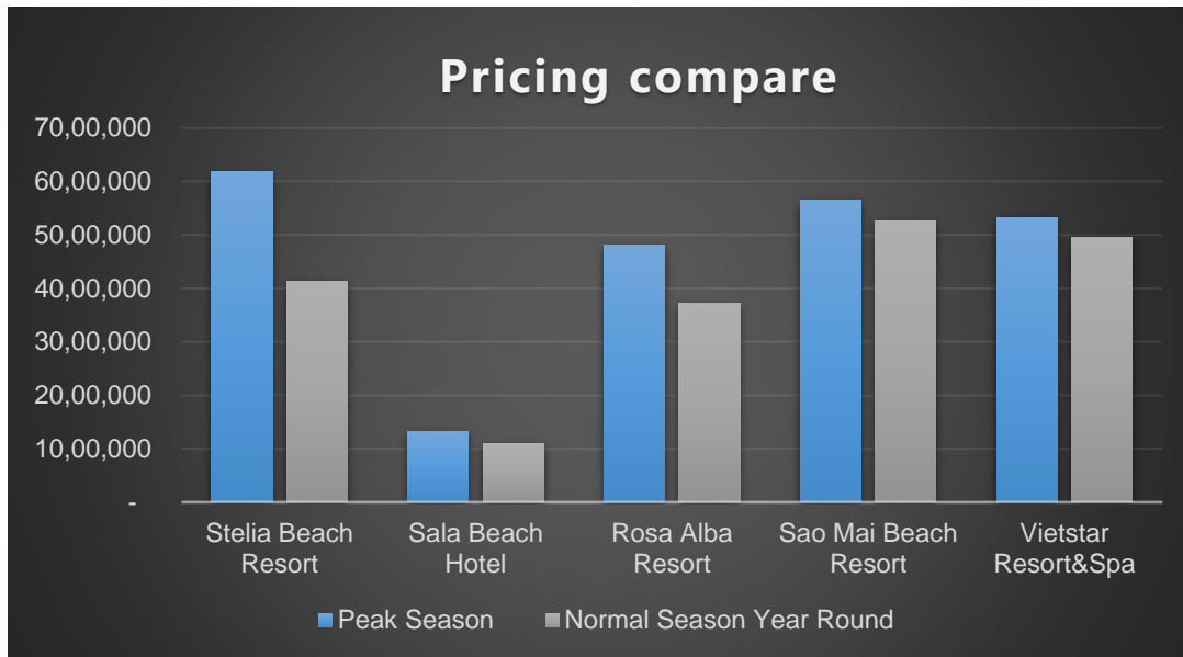
Figure 2. Pricing comparison between resorts in Phu Yen area

The third is about marketing promotion. It is necessary to establish a foundation for brand development orientation, brand association activities with media and commercial partners need to be replicated to raise brand awareness and increase resort value to guests. Raising awareness of protecting brand image, promoting interaction with customers and managing brand reputation is implemented continuously and consistently [2].