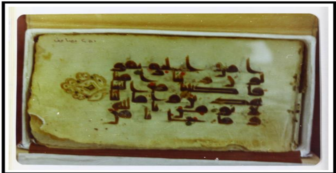
Figure (2) Quran written in Kufic script and gilded and contains shrubs

(24). Al-Baba, Kamel, The Spirit of Arabic Calligraphy , 1st Edition, Lebanon Press, Beirut, 1983, p. 154.