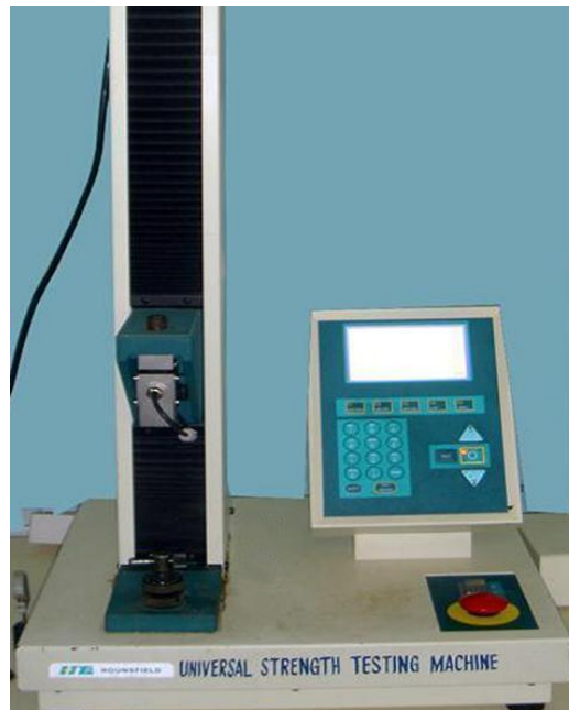
FIGURE 1: Hounsfield Universal Testing Machine