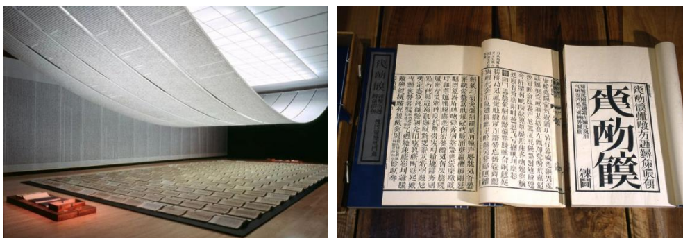
Xu Bing, book from the sky, Period: 1987-1991, Materials: mixed media installation, hand-engraved panels, printing and traditional bookbinding

Deleuze argued that, the artist's vision is subordinate to the objects it perceives, resulting in the loss of directness and strength of his senses. Based on this perspective, Deleuze suggests a practical way for modern painting to avoid such cliché reproductions and acquire a sense of purity, which is "to erase the canvas". This means that the artist should not reproducing the facing model on an empty canvas. The canvas is already full of potential images, so the artist is not painting on an empty canvas. Canvas looks white, but there are so many cliché things in them. Therefore, the artist should not fill the empty canvas with something, but rather erase the cliché and reproducible stuff that is full of it. Which means that it must move toward pure form through abstraction and to purely shape through extraction or isolation. It is a new interpretation of canvas, which has usually been considered material, and refers to the pure state of canvas, which can contain the artist's pure sense of being. It is in line with Oriental painting techniques such as "Post-painting". In my opinion, this explains why contemporary artists are so successful in presenting their artistic ideas in a large number of ready-made works.