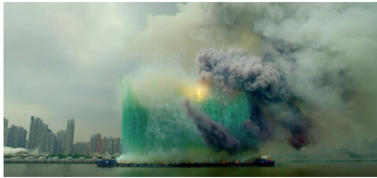
Cai Guo-Qiang , Huangpu River outside the Museum of Contemporary Art, Shanghai, screenshot from the opening of the solo exhibition "Nine Levels of Waves", 2014.08.08

Fireworks have been an essential participant in large festivals in China for thousands of years, and Cai Guo-Qiang used them to their fullest extent. Early on he designed the type of pyrotechnics to be measured and proportioned to make the desired effect on a traditional canvas after ignition (both the process and the result of the ignition are part of Cai's work). He then discovered that he could use the sky directly as a canvas for his work. Cai Guo-Qiang's masterpieces include his ambitious plan to extend the Great Wall of China by 10,000 metres, the large landscape fireworks display at APEC in Shanghai, the Moving Rainbow and Wheel of Light, representing justice and righteousness in the aftermath of the September 11 terrorist attacks, and his recent work at the Chinese Cultural Festival in the US capital, which is a symbol of the Chinese culture. The Tornado, a symbol of Chinese culture and power, was created at the recent Chinese Cultural Festival in the US capital, among other large-scale explosive art designs. For example, Cai Guoqiang's solo exhibition 'Nine Levels of Waves', which the artist describes as being inspired by his return to his home port in Fujian after many years away.