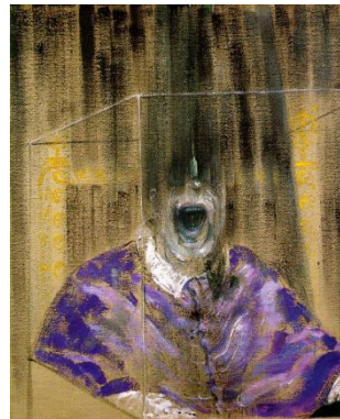
PAPA INOCENCIO X, POR FRANCIS BACON