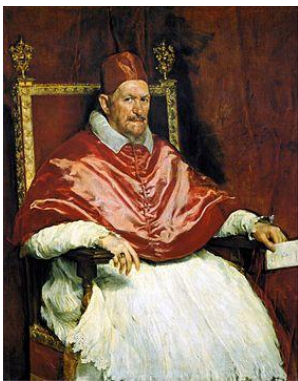
PAPA INOCENCIO X, POR VELAZQUEZ

In Bacon's painting of Pope Innocencio X, for example, the traditional dignified and serious posture of the pope is gone, swept away and replaced by a black curtain under which the constraint of a non-visible force is felt in his howling posture, and his senses gain strength in the struggle when his body is oppressed and struck by external forces. This is what Deleuze considers to be a characteristic: "the intersection of two senses existing in the body at different levels, which are as tightly entwined as gladiators" . The senses are wrestling and intermingling with each other at this moment, bringing the possibility of rhythmic change, "drawing the senses, which are essentially rhythmic" , in this process of rhythmisation, the senses transcend their figurative character and merge with the inner nature of life, giving it the possibility of vital intensity.