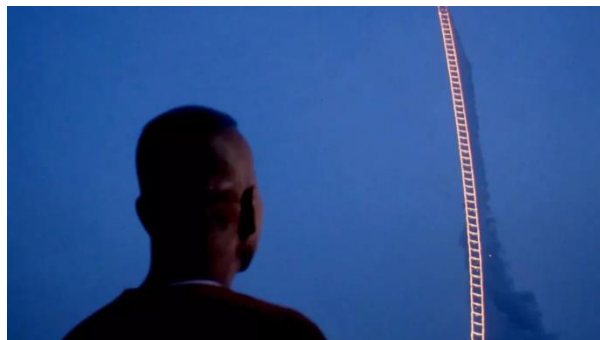
Cai Guoqiang , Stairway to Heaven, Quanzhou, China, 15 June 2015 at dawn

The opening of Nine Level Waves was inspired by the painter Aivazovsky's painting of the same name, Nine Level Waves. The exhibition not only confronts the ecological issues of the earth, including China at the moment, but also extends to the relationship between man and nature, linking traditional Chinese poetic aesthetics and philosophies, including man's contemplation of nature and his search for the original landscape and spiritual homeland. We can see that in presenting his works, Cai Guo-Qiang not only considers the local climate, wind and geography in relation to the specific nature of the materials used in his works, but also considers the themes of his works in light of the local human characteristics. These themes are presented through the element of gunpowder, and each creation is a re-expression of the same formative language system.