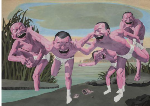
Yue Minjun , Idle Clouds and Wild Cranes, oil on canvas, 280×400cm

in the form of a tactile sense that intervenes in the work, and the sensation itself expands its intensity. This provides a theoretical explanation for the new power of abstract expressionist paintings such as Jackson Pollock's, which are distinctly different from traditional Western realistic paintings.