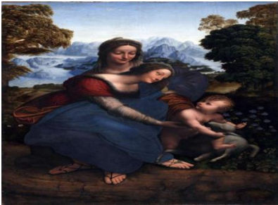
Model No. (1)

Third: The research tool: The indicators of the theoretical framework were relied on in the analysis of samples