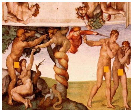
Model No. (2)

We also note that there is an emotional relationship between the mother and the child that feels inherited authenticity. The painting is outwardly homogeneous with personal psychology, as it involved an impersonal subject, the double mother, which is a primitive model that we find in various forms in mythology and comparison of religions. That is, descent from two parents, one divine and the other human.