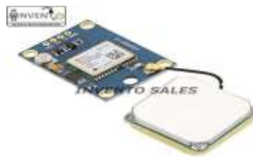
FIG 1.3: Global positioning system

Global Positioning System is used for determining the location of a receiver which gives latitude and longitude on the earth by calculating the time difference for signals from various satellites to reach the receiver. The GPS module contains 4 pins i.e. RXD, TXD, GND, and power supply. We have used only 3 pins. The signal is received by the antenna. So the RXD pin is not used in the module. The TXD pin is used for transmitting the latitude and longitude to the other devices. The GND is used to maintain the frequent current supply to the GPS module.