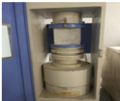
Fig-4.2. Specimen loaded into testing machine