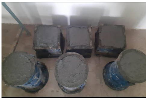
Fig-4.1 Preparation of samples

They're then put in the curing tank to cure