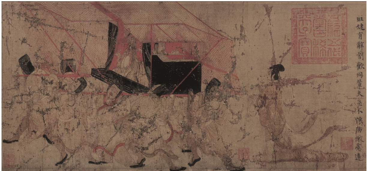
Admonitions Scroll (Consort Ban refused to take the same imperial carriage with Emperor Cheng of Han), Gu Kaizhi, Eastern Jin Dynasty

women, a strong way of lecturing. With images on the left and history on the right, such paintings are similar to moral education books in modern schools, and greatly facilitate people's understanding. Paintings like Admonitions Scroll, are quite common in Chinese painting history, aiming to spread traditional Chinese virtues and moral beliefs by depicting historical facts or directly making up stories. With the viewer's covering the majority of people in ancient China, such paintings are still one of the mainstream educational methods in ancient China, even though the spreading range is limited to the development of media technology.