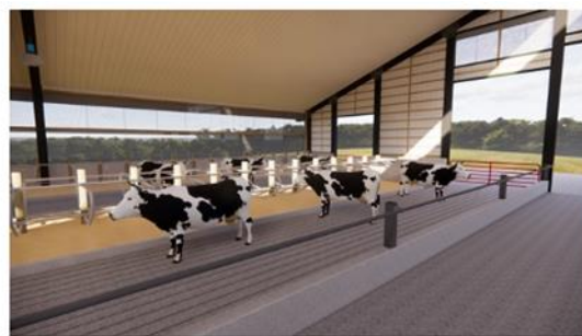
Figure 1b. Edu-tourism of dairy cows