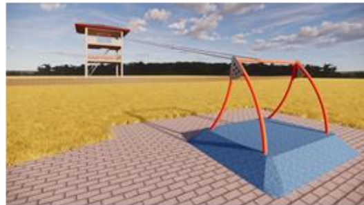
Figure 2d. Flying fox