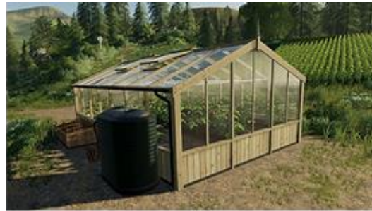
Figure 2b. Edu-tourism of vegetables