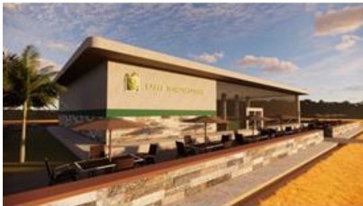
Figure 2c. Cafe