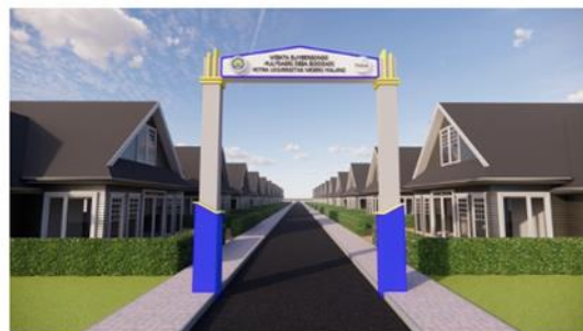
Figure 1c. Gate for Sidodadi village