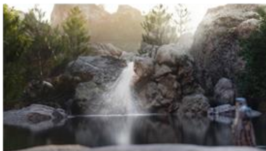
Figure 2e. Sumber songo waterfall