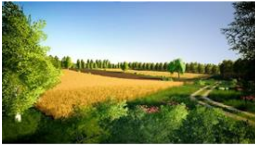
Figure 2a. Edu-tourism of planting paddy

Accommodation and supporting infrastructure for creative tourism development. Tourism activities are not only limited to the fulfillment of attractions in tourist destinations but also include the fulfillment of the need for services as long as tourists are in tourist destinations. The tourism facilities provided in Sidodadi village is edu-tourism for planting paddy and vegetables (see Figure 2a and 2b). Furthermore, the Sidodadi village-based tourism also offers a cafe (figure 1c) and souvenir center (figure 1f) to facilitate the tourists visiting the area. It will expect to accommodate what the tourists need and want. Lastly, this project enables tourists to enjoy flying fox (figure 1d) and “Sumber Songo” waterfall (figure 1f).