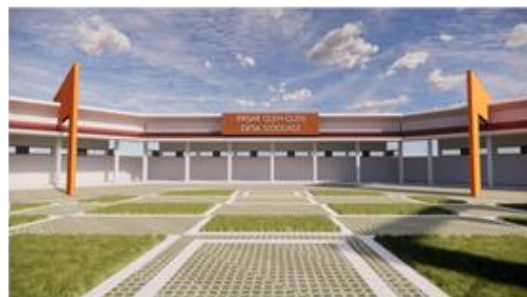
Figure 2f. Souvenir center