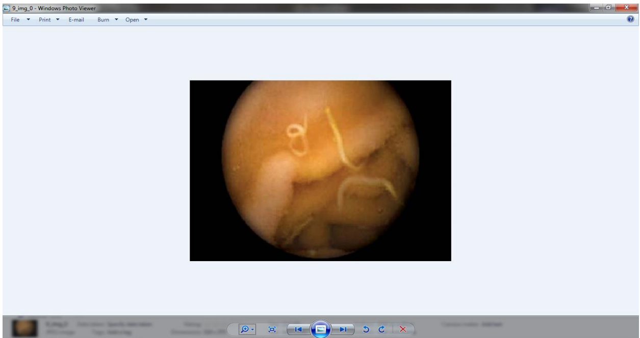
Fig(2) in this output image multiple hook worms are detected from WCE image using machine learning

Here a single hookworm is detected from WCE image using machine learning