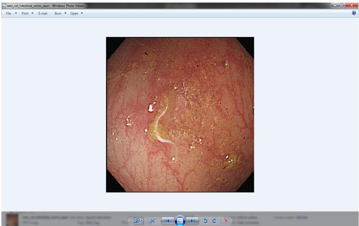
fig(3) Here from this WCE image among the different cells specially hookworm is detected using its shape and colour by machine learning technique.