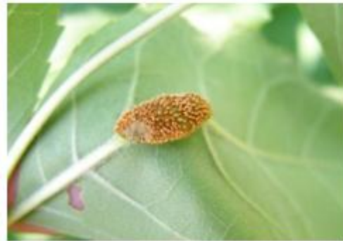
Figure 3: Ash Rust