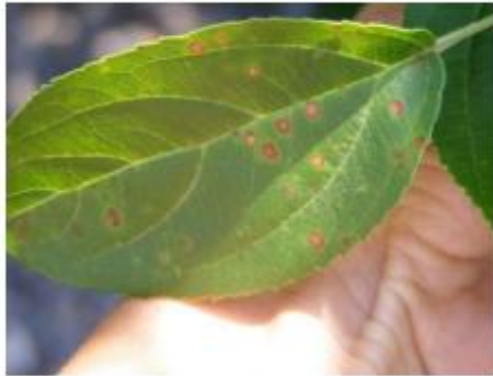
Figure 2: Frog Eye Leaf Spot

lemon leaves, bacterial and fungal disease on bean leaves, and early scorch disease on banana leaves are only a few of the common illnesses that have been studied.