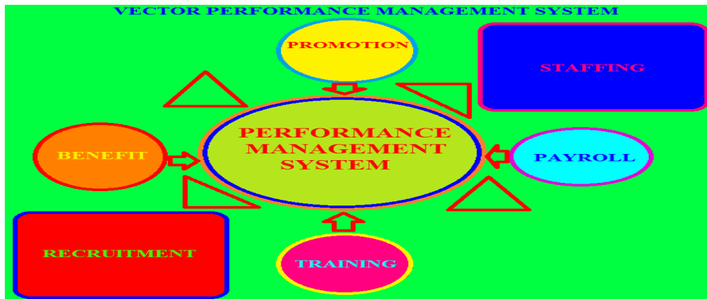
FIGURE NO.2 Recent Situation OF VECTOR PERFORMANCE MANAGEMENT

prizes driven way to deal with execution the board isn't feasible for the vast majority of the associations. In addition, conventional associations have additionally begun getting to be information escalated for innovation concentrated assembling forms.