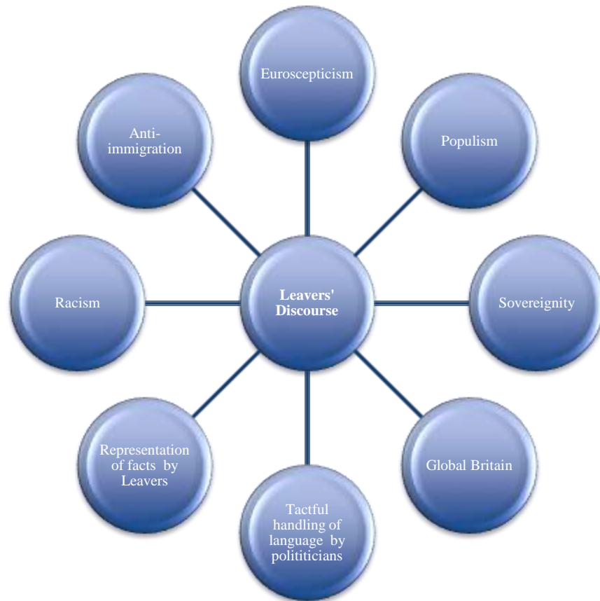
Figure 3. Figurative Representation of Main aspects of the Leavers' Discourse

Leavers' discourse is colored with various shades depicting the sociocultural, sociopolitical and ideological influences of British people belonging to Leavers' campaign. These are demonstrated in Fig. 3 as follows: