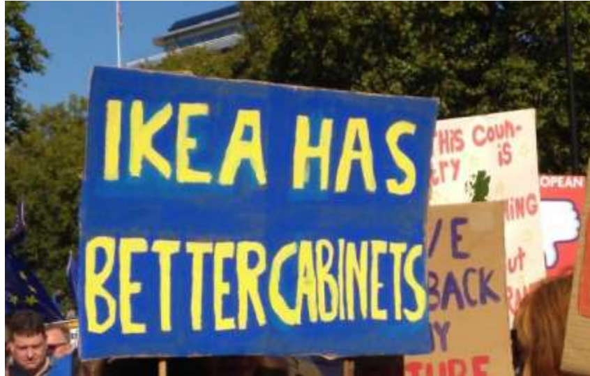
Figure 8. (Gerda, 2019)