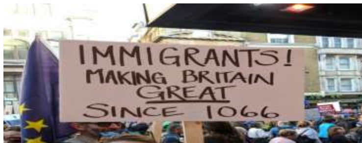
Figure 7. (Gerda, 2019)

In Fig. 7, reference to the year 1066 in history is made by the Remainers in relation to the immigrants indicating that just as after 1066, no nation has been able to invade England rather preferred seeking friendly relations with the UK, immigrants are no exception. They are not a crisis but a contribution towards making Britain Great.