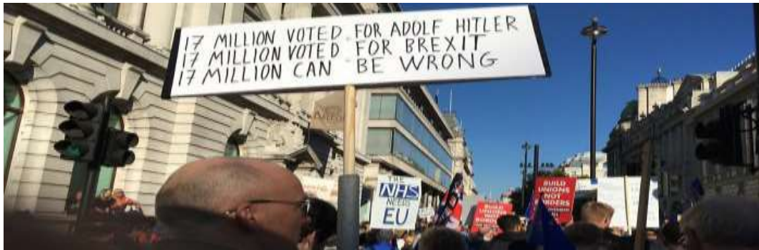
Figure 6. (Gerda, 2019)

recession and related gravity of the situation in a post-Brexit Britain led them to relate Brexit with economic genocide of the UK.