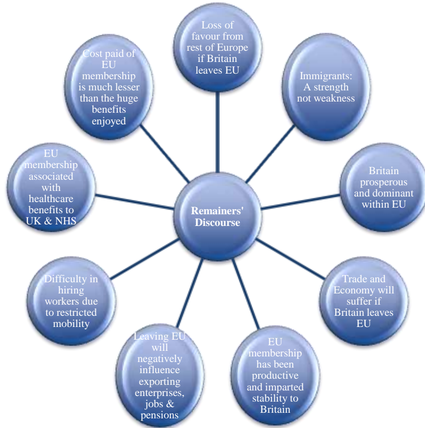
Figure 4. Figurative Representation of Main aspects of the Remainers' Discourse

Now, we will discuss briefly some main aspects of the above shown anti-Brexit arguments of Remainers as follows: