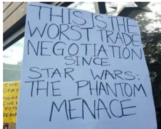
Figure 5. (Gerda, 2019)

The pro-EU protesters of the Remain campaign particularly expressed their opposing views regarding Brexit through various sorts of intertexts displayed on their placards. For example, the text on placard shown in Fig. 5 marks government trade negotiations as “WORST” and intertextually relates these to a film titled “Star Wars: THE PHANTOM MENACE” made in 1999. Here, these protesters are trying to demonstrate that the current government with a pro-Brexit stance is not competent enough to carry out successful trade negotiations with the EU as was the case with the protagonists of the film, i.e., Qui-Gon Jinn Obi-Wan Kenobi and Anakin.