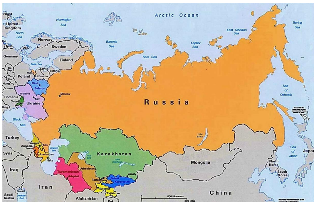
Figure 2. Geographical Location of the Former Soviet Union and its Independent States

coasts reached 653.37 km (Abazari Fomashi, 2012, 35). Because most of its coasts were located in the North Frigid Zone or its related seas were connected to free canals through the straits controlled by other countries, the Soviet Union did not have an ideal position to establish a free sea connection with the rest of the world, and suffered from lacking proper access to open waters. This was considered a main geopolitical and crippling problem for that country. (Amir Ahmadi, 2007, 37). As the world's leading communist think tank, this country was one of the two great poles of the world power during the Cold War, and one of the five permanent members of the UN Security Council.