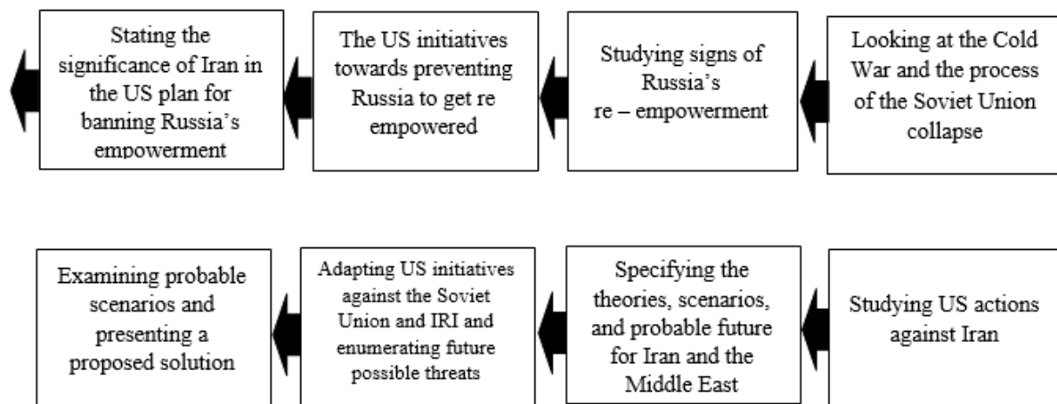
Figure 1. Research Process