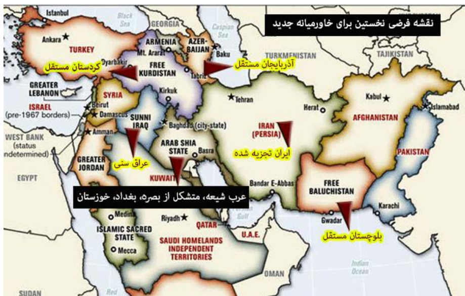
Figure 3. Bernard Lewis Ideal Map for the Division of the Middle East (www.mashregnews.ir)