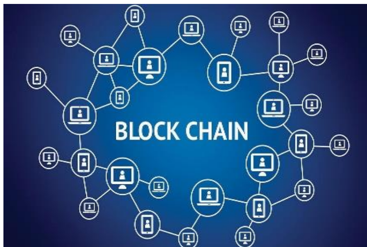
Fig 3.1. Blockchain structure

There is a whole chain lying or is to make events and groupings. So this industry makes or changes to destroy or it can't be deformed.