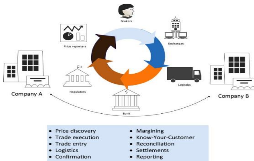
Fig. 3.2 Blockchain Technology.