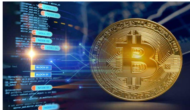
Fig 3.3. Bitcoin with Blockchain