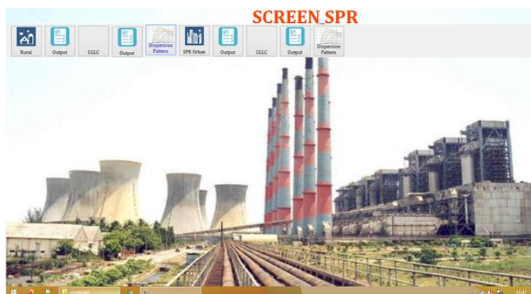
Figure-1: Main page of the SCREEN SPR model

The main page of the SCREEN SPR model is shown in the figure-1.